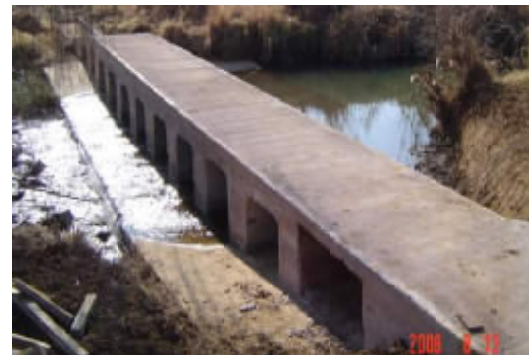
The completed bridge across the Moreleta at the old ford. More photos of the project are available on the website.

We would also like to wish you all a safe and happy holiday season and a prosperous new year.